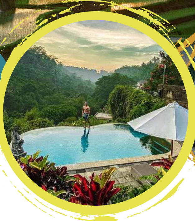
The Payogan Villa Resort & Spa Ubud