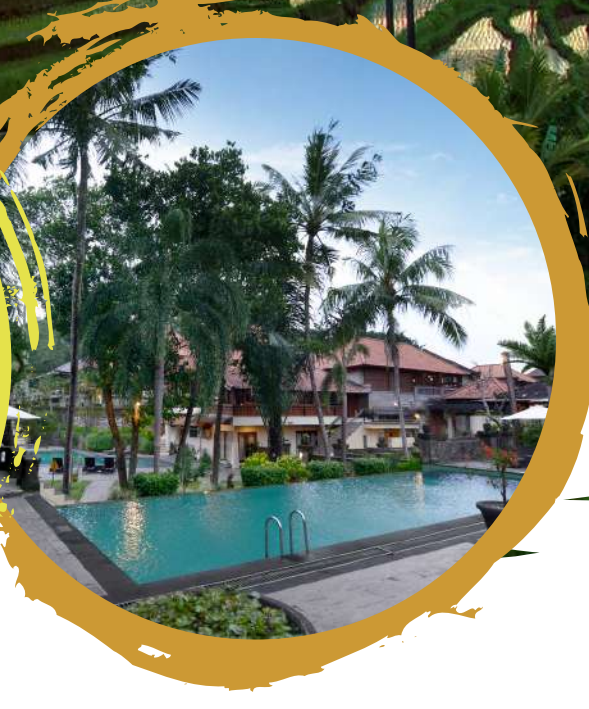
Champlung Sari Hotel Villa & Spa Ubud