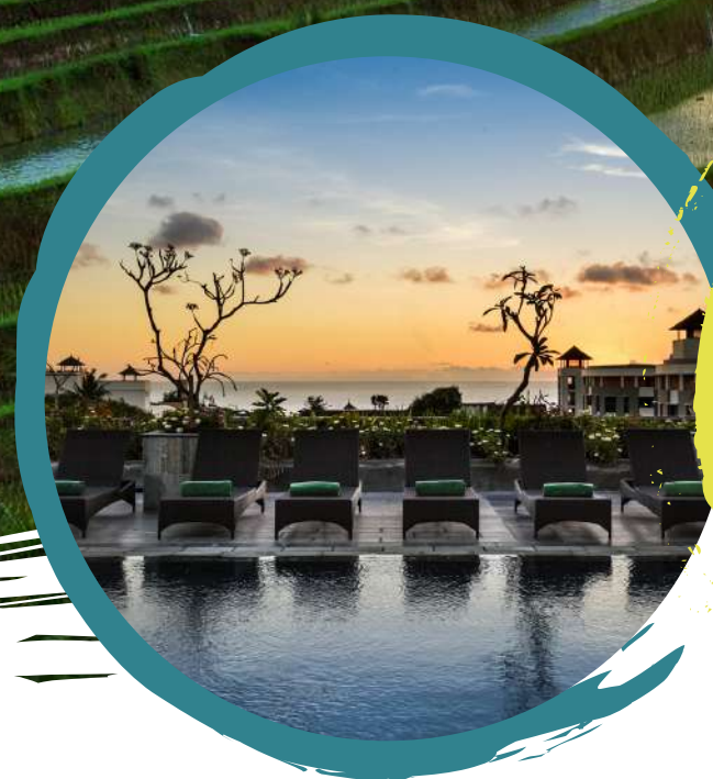
Champlung Mas Hotel & Spa Legian